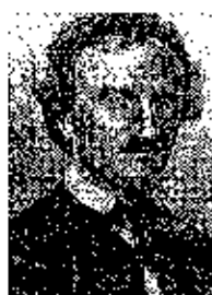
Edgar Allan Poe