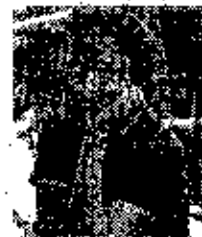
Naomi Shihab Nye